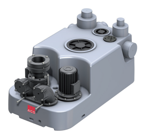
ACO Muli Star DDP